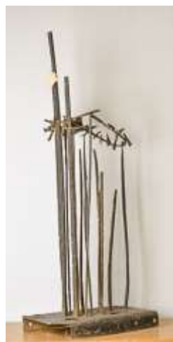
Fig.16: The Arab unification , 1974, The Museum of Egyptian Modern Art, no.8276, Iron, 120cmx70cm, (photo @ Hazem Taha Hussein)