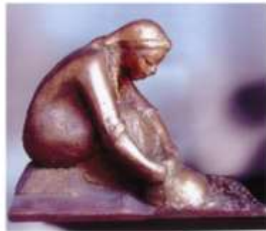
Fig.2: Jar holder , 1954, Colored Gypsum, 25×18 cm, Artist's private collection, @Mona Taha Hussein