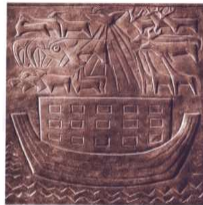
Fig.5: Noah's Ark , 1960, Bronze, H.45cm×W.30cm, Artist's private collection, @Mona Taha Hussein