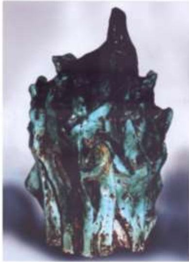
Fig.7: Death , 1970, Ceramic glazed, 45cm×30cm, Artist's private collection, @Mona Taha Hussein