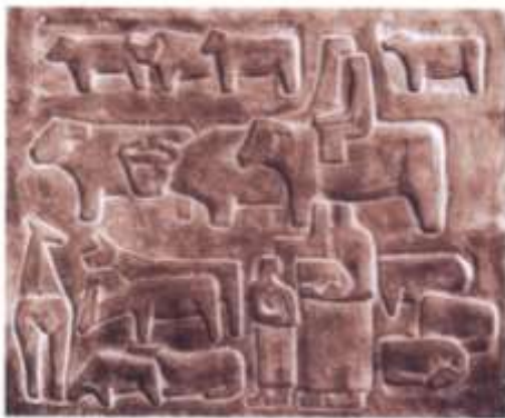
Fig.6: Egyptian countryside , 1960, Colored Gypsum, H.45×W.35 cm, Private collection, Germany, @Mona Taha Hussein