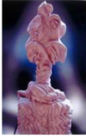
Fig.11: Belonging to the Homeland , 1980, Polyester, 103cm×52cm×28cm, Artist's private collection, @Mona Taha Hussein