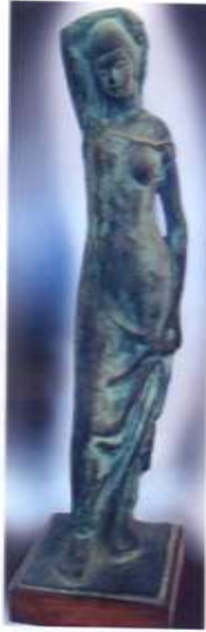
Fig.1: Egyptian farmer , 1952, Colored Gypsum, 45×15×15 cm, Artist's private collection, @Mona Taha Hussein