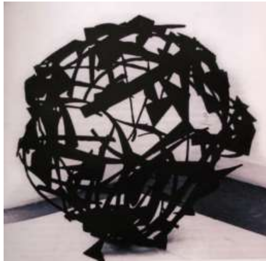
Fig.17: Israel vision of peace , 1975, The Museum of Egyptian Modern Art, Iron, 100 cmx100cm, (photo @ Hazem Taha Hussein)

The sculpture is made out of scrap metal and symbolizes the world and Israel's views toward peace with the Arab world.