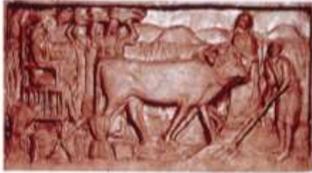
Fig.3: The harvest , 1955, Colored Gypsum, H.120×W.60 cm, Artist's private collection, @Mona Taha Hussein