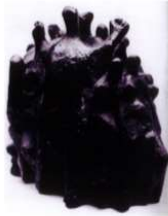
Fig.8: The awakening , 1973, Ceramic colored black, 50cm ×35cm, Private collection Germany, @Mona Taha Hussein