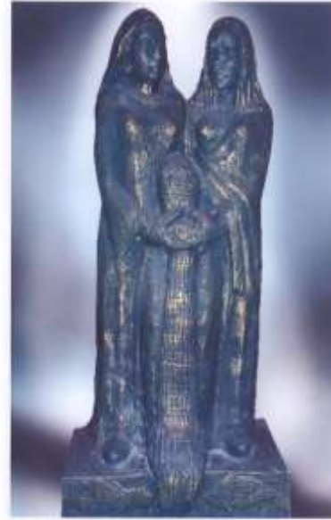
Fig.4: Egypt and Sudan , 1955, Colored Gypsum, 90×60×40 cm, Artist's private collection, @Mona Taha Hussein